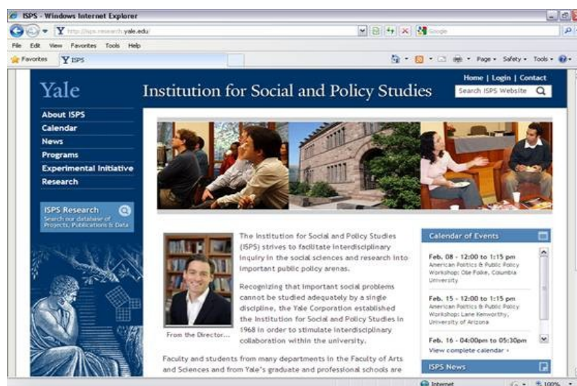
Figure 1. ISPS website.

size, and tracks status changes over time. The Publication database includes basic citation information and links to published journal articles. We then turned our attention to the third element: Data. At this point, ISPS partnered with Yale's Office of Digital Assets and Infrastructure (ODAI) to find solutions relating to storage, persistent linking, long-term preservation, and integration with a developing institutional repository. As such, ISPS became a pilot project within the full institutional context, helping to identify issues specific to digital preservation of data across the campus.